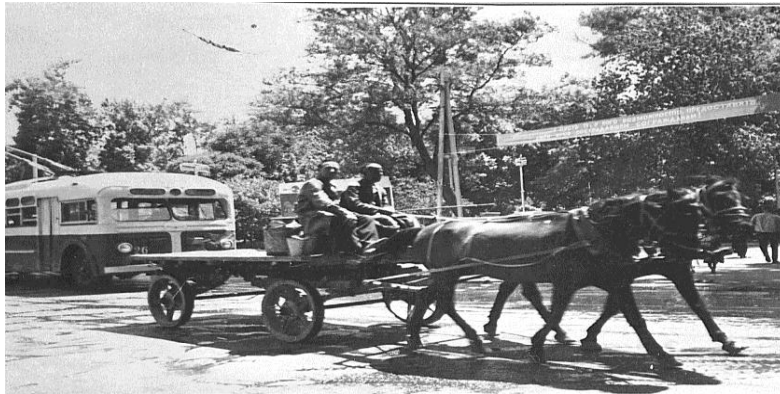
Figure 1. Tashkent looks

Currently, the total area of Tashkent is about 334.8 square kilometers or 33.8 thousand hectares, and the population is 2.3 million around. In 1939, it was the eighth largest city in the former Soviet Union, and by the 1970s, it was the fourth largest (Tashkent. Encyclopedia. 1992.) city in terms of land area and population, after Moscow, Leningrad (now St. Petersburg), and Kiev. In order for our readers to get a clear picture of Tashkent, the two most popular German cities are Cologne (area of about 405.15 km 2 , population 986,168 thousand people) and Munich (area of about 300.00 km 2 , the population of one million three hundred thousand people). Around). To date, Tashkent consists of eleven administrative districts. These are Bektemir, Mirzo Ulugbek, Mirabad, Sergeli, Sabir Rakhimov, Uchtepa, Hamza, Chilanzar, Shayhantahur, Yunusabad, Yakkasaray districts, where a total of 474 mahalla and quarter committees, local self-government bodies operate. Here is some information for comparison. At the beginning of the 19 th century, the city consisted of four districts: Shayhantahur, Sebzor, Kokcha and Beshyogoch. The city area at that time was only 16 km 2 and had a population of 80,000 (some sources say around 100,000).