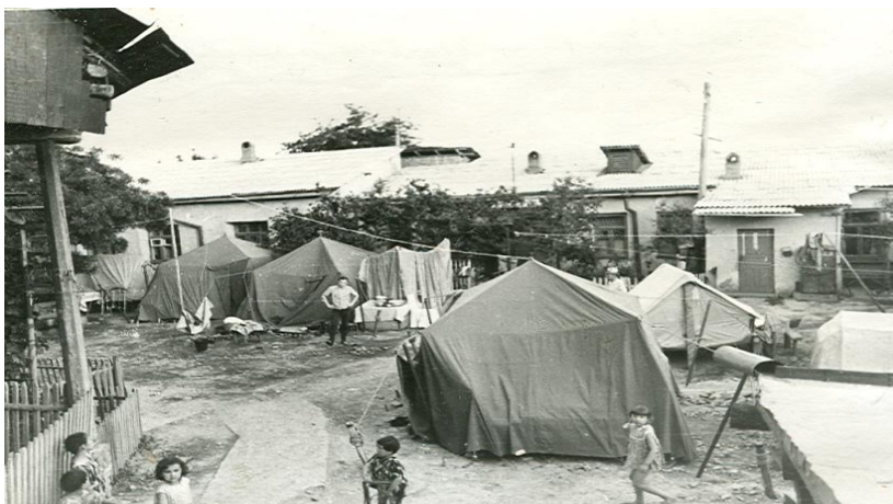
Figure 6. Tents effect Tashkent earthquake

To eliminate the consequences of the earthquake, the Tashkent Fund was established and its account number was set at 170064.