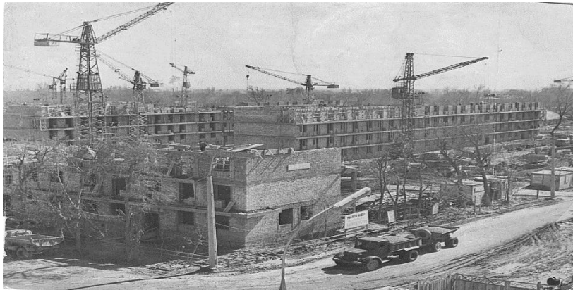
Figure 8. Houses built during the Tashkent earthquake

On the recommendation of the Republican Government Commission, the Council of Ministers of the Uzbek SSR adopted a resolution "On some measures to mitigate the effects of the earthquake in Tashkent." According to the decree, the Ministry of Education was allowed to cancel the entrance exams in grades 5, 6, 7 and 9 and finish the school year on May 14 in these classes. . (Soviet Uzbekistan newspaper, May 13, 1966). Many university students have been actively involved in mitigating the effects of the earthquake (Meza et al., 2017; Maledo & Edhere, 2021).