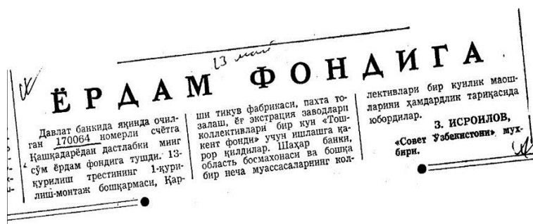
Figure 7. Account number fund for Tashkent earthquake

To eliminate the consequences of the earthquake, the Tashkent Fund was established and its account number was set at 170064.