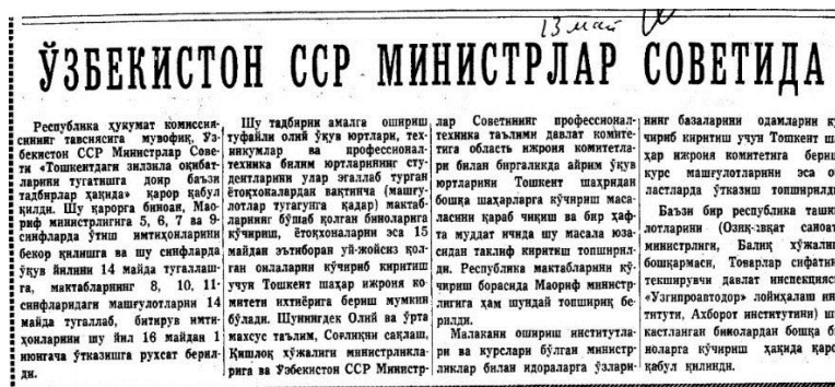
Figure 9. Soviet Uzbekistan newspaper

On the recommendation of the Republican Government Commission, the Council of Ministers of the Uzbek SSR adopted a resolution "On some measures to mitigate the effects of the earthquake in Tashkent." According to the decree, the Ministry of Education was allowed to cancel the entrance exams in grades 5, 6, 7 and 9 and finish the school year on May 14 in these classes. . (Soviet Uzbekistan newspaper, May 13, 1966). Many university students have been actively involved in mitigating the effects of the earthquake (Meza et al., 2017; Maledo & Edhere, 2021).