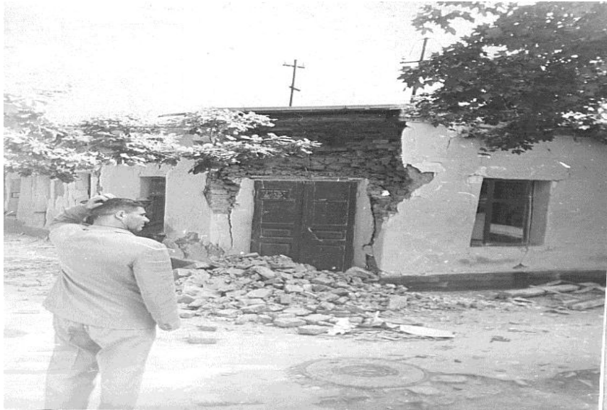
Figure 5. Effect Tashkent earthquake

As a result of the Tashkent earthquake 2 million sq.m. more than 236 administrative buildings, about 700 trade and catering facilities, 26 utilities, about 180 educational institutions, including schools with 8,000 seats, 36 cultural institutions, 185 medical and 245 industrial enterprises were damaged. 78,000 families or 300,000 people from the cities were left homeless ( Tashkent. Encyclopedia. 1992). For comparison, we draw attention to the following data (Rikitake, 1968; Zmazek et al., 2003). One of the smallest sports complexes in Tashkent is Pakhtakor Central Sports and Training Association. If you want to understand it in a broad sense, you will see the favorite football team of the Uzbek people - Pakhtakor. The total area of the sports complex is 72 hectares or 7,200 square meters. If we only imagine the destruction of residential buildings, we will have to embody approximately 280 Pakhtakor Central Sports and Training Associations.