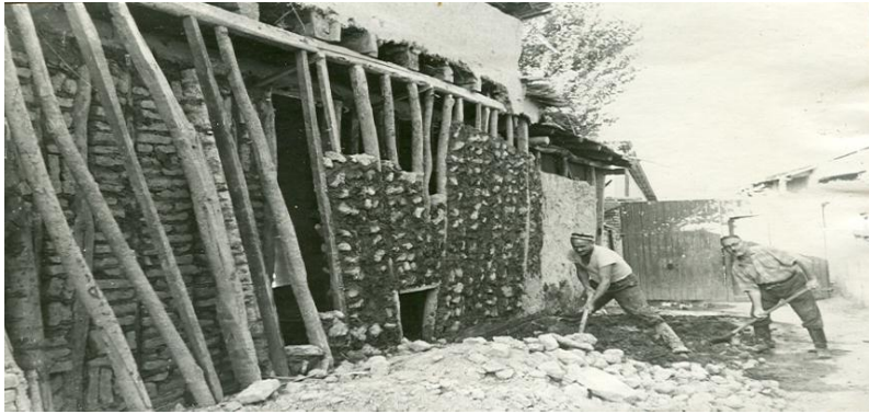
Figure 12. The Uzbek people are naturally hospitable, tolerant, and hardworking

TASHKENT EARTHQUAKE... Nowadays, it is more important than ever to fight against high-level cohesion, stability, peace, iron-clad discipline, and all kinds of rumors and provocative rumors circulating the natural disaster in Tashkent. It is very important to inspire high labor enthusiasm in every production team, to work hard, to take all necessary measures to complete the first tasks of the five years. (Soviet Uzbekistan newspaper, May 15, 1966). Even in the most difficult moments, full opportunities were created for the cultural recreation of the townspeople.