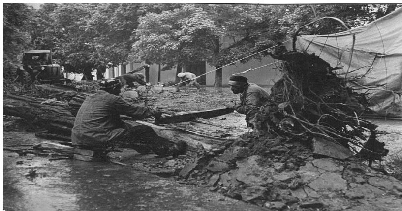
Figure 3. Effect Tashkent earthquake