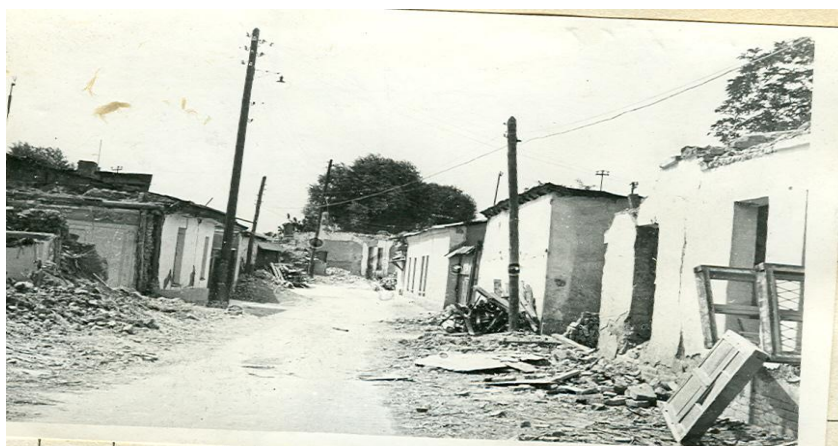
Figure 4. Effect Tashkent earthquake

THE TASHKENT EARTHQUAKE is the longest continuous earthquake in the history of the capital. The number of earthquakes from April 26, 1966 to December 31, 1969 was 1,102. The strongest oscillations, i.e., 7 points and above, occurred on May 9, 1966, May 24, June 5, June 29, July 4, and March 24, 1967. People lived (Tashkentskoe zemletresenie. 1966) in tents and in the courtyards of their homes out of depression and fear.