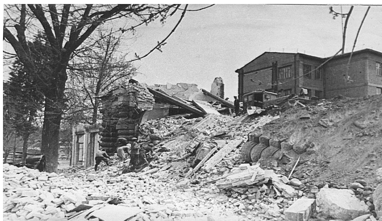
Figure 2. Tashkent earthquake

“Sovet Uzbekistani”, the country's main newspaper at the time, and almost all other media outlets reported that "four people were killed in the earthquake of April 26, 1966, and about 150 were hospitalized" (Soviet Uzbekistan newspaper. 1966). The government of the country will develop measures to immediately eliminate the consequences of the earthquake and set up a government commission responsible for it.