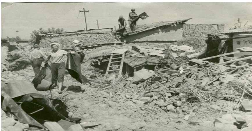
Figure 10. Tashkent earthquake