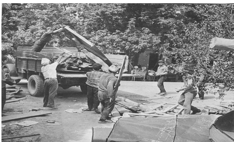
Figure 11. Tashkent earthquake

TASHKENT EARTHQUAKE ... 12 days have passed since April 26. The ground is still shaking. On April 29, at 11:48 a.m., a seismogram tape-recorded an earthquake with a magnitude of 5-6. After that, the magnitude of the earthquake decreased. 178 times more than 2 points, 42 times 2 points, 22 times 3 points, 13 times 4 points and 7 times 4-5 points, a total of 264 earthquakes in 12 days (Soviet Uzbekistan newspaper, May 9, 1966).