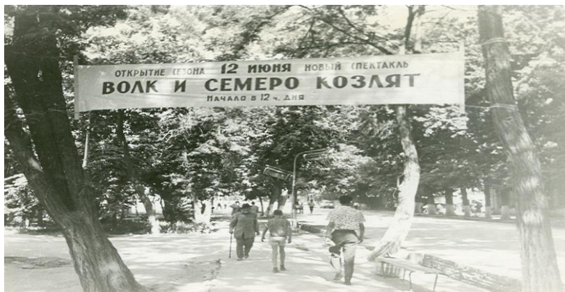
Figure 14. Tashkent looks